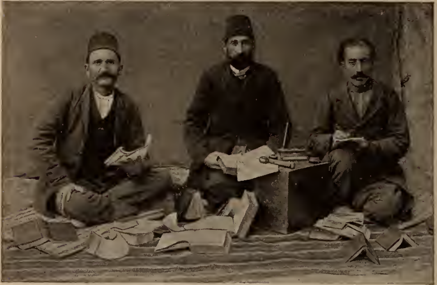
TRANSLATORS OF THE KOORDISH BIBLE.

In the southeastern part of the Harpoot field a good many nominal Christians — Armenians and Jacobites — live among the Koords. They are extremely ignorant. In appearance, in dress, in character, in language, in everything except the name and some of the rites of Christianity they are essentially Koords. About twenty years ago the Harpoot Evangelical Union commenced a missionary work in that part of Koordistan, and it is continued with a good degree of success to the present time, with the aid of the other evangelical churches of this country. In missionary work one of the first things is to give the people the